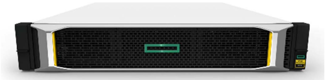
HPE MSA 1050 SAN Storage

Notes: * US Street Price (MSA 1050 base unit, dual 1GbE iSCSI controllers, four 300GB HDDs); prices are subject to change without notice.