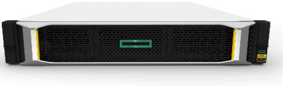
HPE MSA 2052 SAN Storage