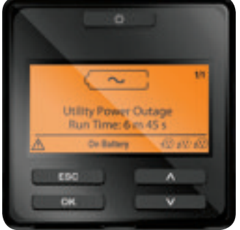
Connect Battery close Net Available A 08