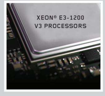
MORE POWERFUL, RELIABLE

Latest Xeon® E3-1200 v3 processors and advanced data protection to handle the demands of your growing business